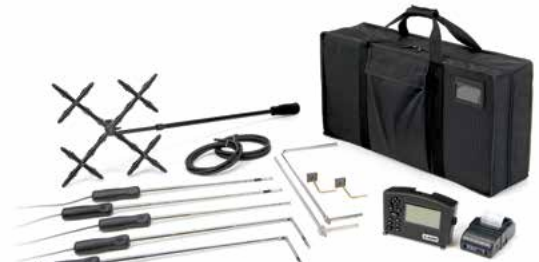
Model 8715 - shown with standard and optional accessories