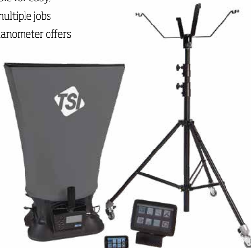
Model 8380 - shown with standard and optional accessories